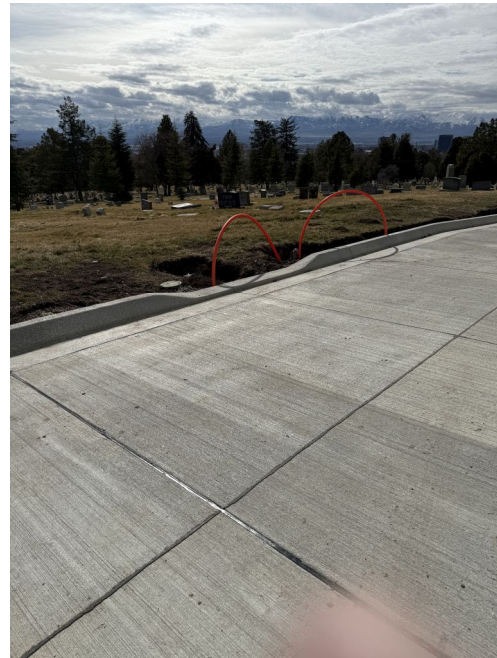
Concrete ready to open in Phase 2