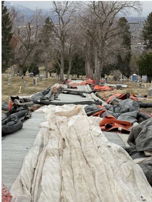
Phase 1 Concrete Complete