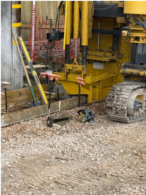
Curb Startin Phase 4