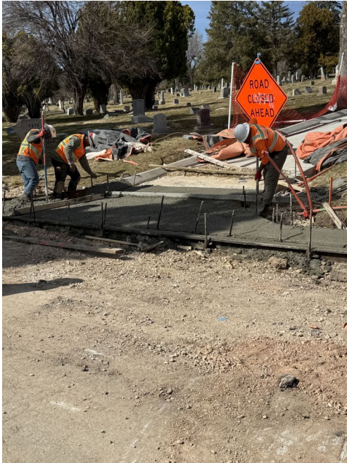
Apron on 1040E