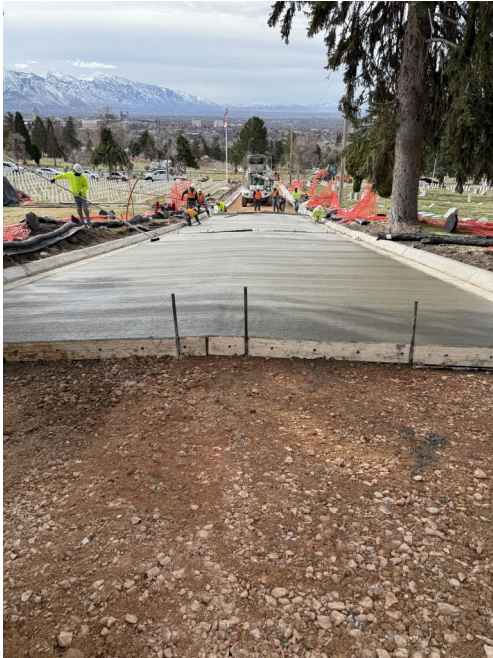
Paving in Phase 3