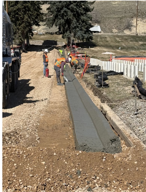
Curb in Phase 3