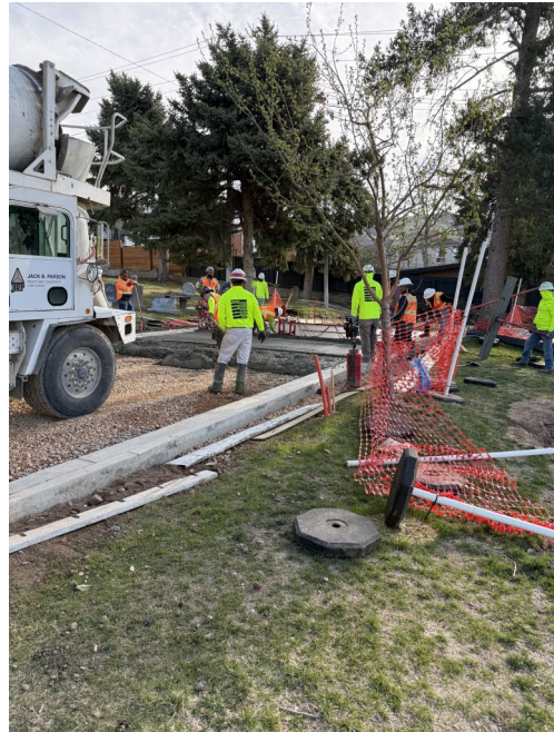
Paving in Phase 4