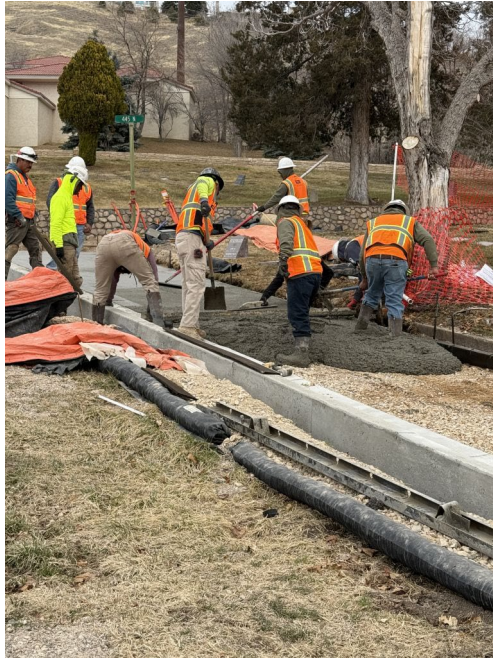
Paving Phase 1