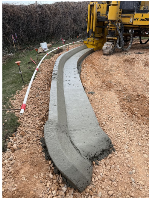
Corner Curn in Phase 4