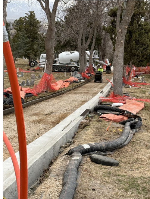
Moving Concrete by buggy