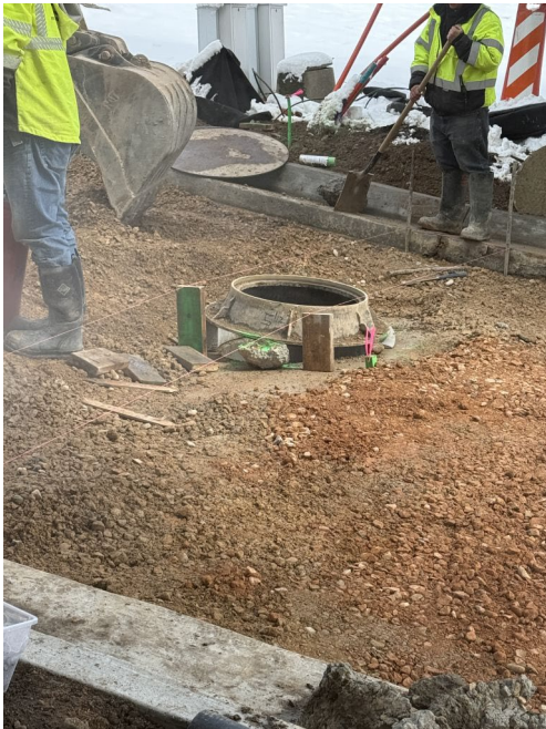
Setting a Manhole on the large PRV Vault