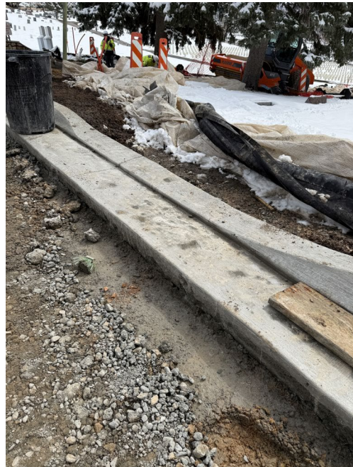
Cemetery Equipment Access