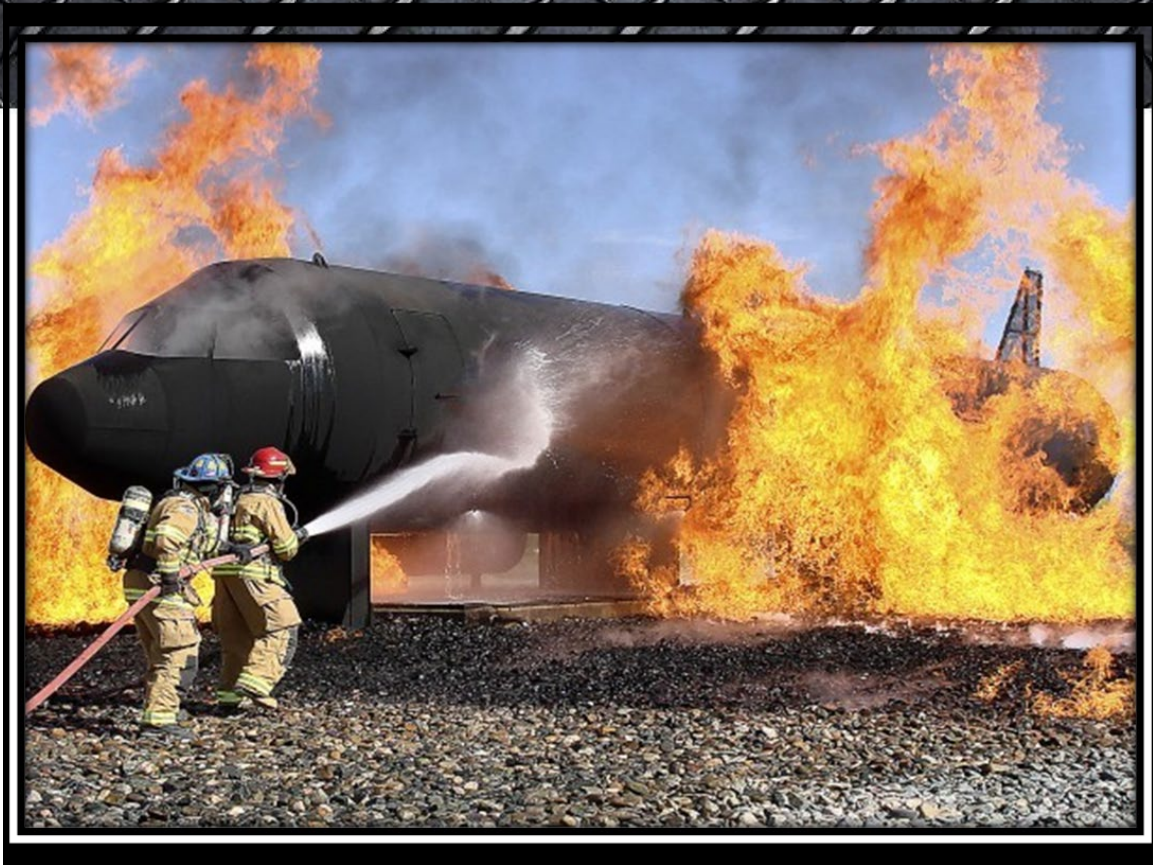
● SLC Fire work at the SLC airport.