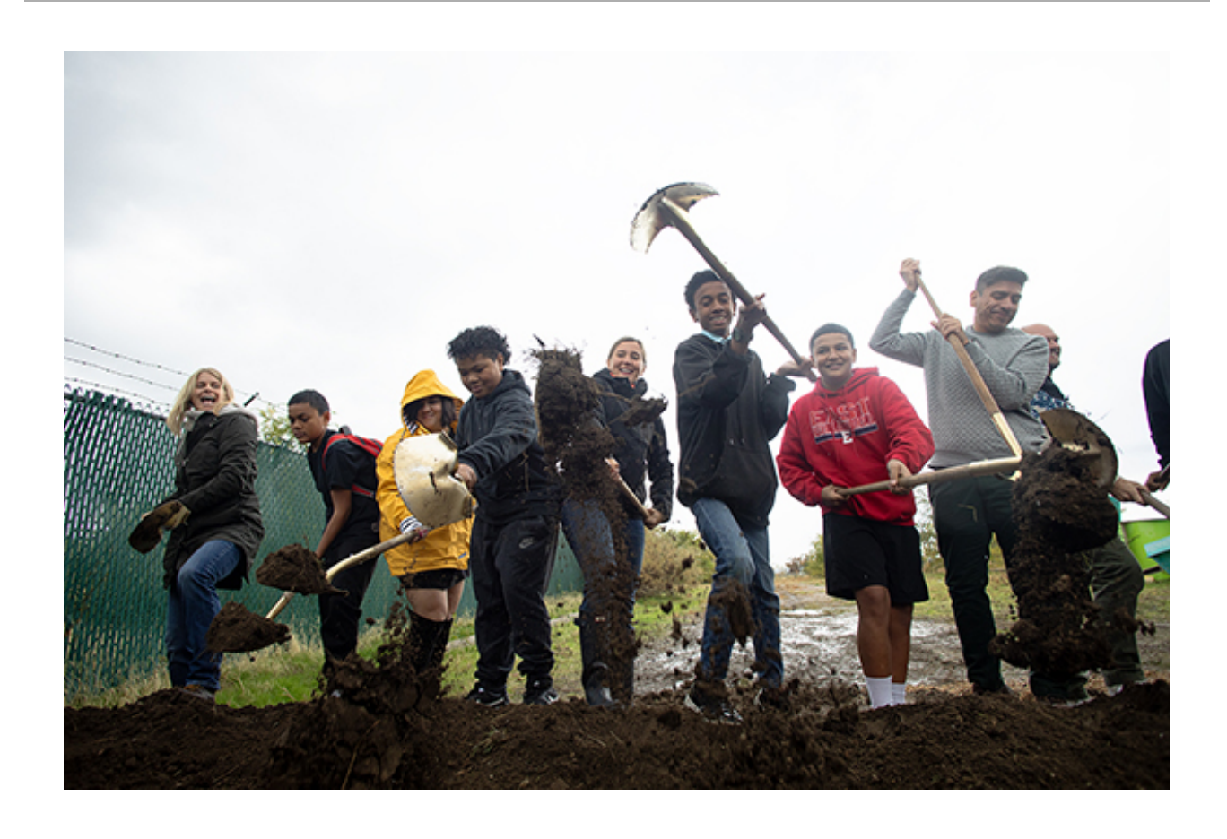
Glendale Park Groundbreaking