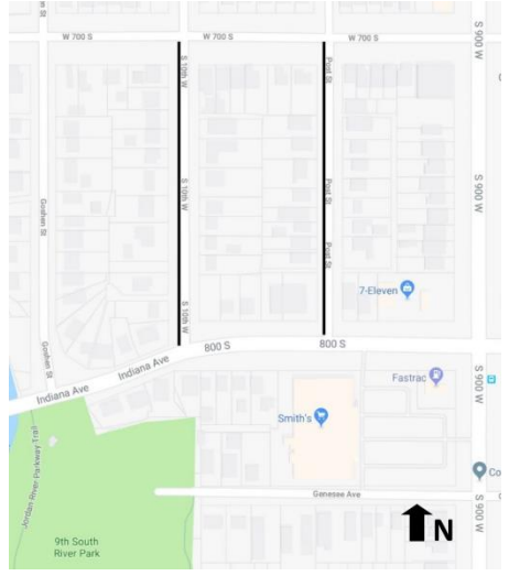
Post St. & 1000 West: from 700 S. to 800 S.

According to City Ordinance 2.60.050, the Poplar Grove Community Council, a recognized community organization, can provide comments on these upcoming projects. Door-to-door updates will be provided to nearby residents and businesses as they near construction.